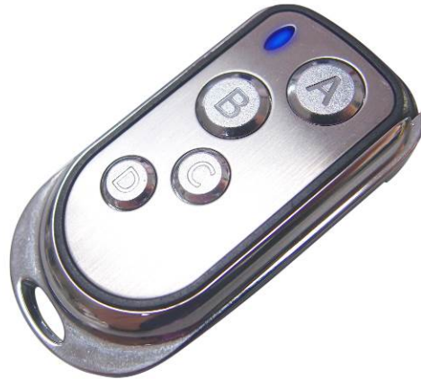
W-2 Wireless Transmitter

Wireless remote control system W-2 consists of a transmitter equipped with four buttons to turn faze output on or off, and adjust output volume; with an onboard receiver attach to the rear panel of Z-380.